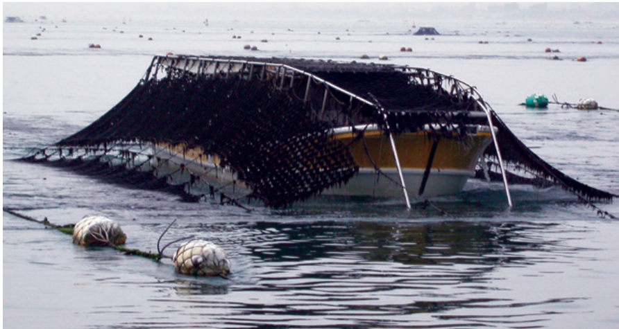
When harvesting red seaweed, specialized boats go under the nori nets. The Porphyra jezoensis is processed into wrappers for sushi rolls.