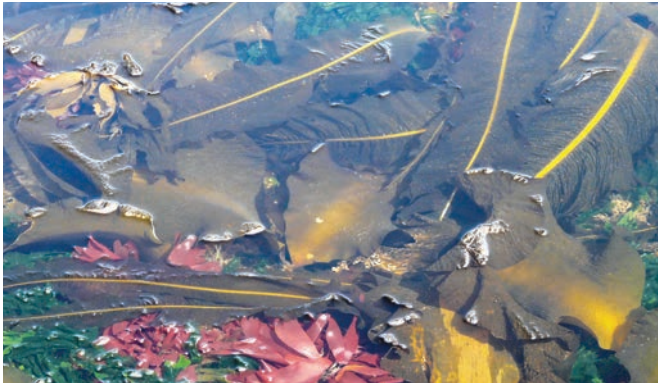
Seaweeds in a tide pool in the Bay of Fundy, New Brunswick, Canada. The kelps are already farmed and others are candidates for future aquaculture development.

still be considered plants, they do not have much in common. The well-known green seaweed sea lettuce ( Ulva ) is closer at the molecular level to a spruce tree than to the well-known red seaweed nori ( Porphyra ), even if their morphology is very similar, and they are found close to one another on the shore.